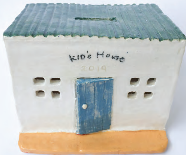
Hierdie spaarbussie, "Kids' House", is ontwerp deur Dianne Heesom-Green. Dit is 13 x 12 x 10 cm groot en word deur die Paternosterprojek NWO aan restaurante, winkels en hotelle in Paternoster verskaf om geld in te samel. Indien jy een benodig, kontak ons gerus via ons webtuiste.