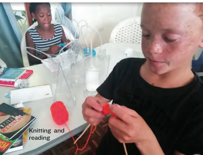
Knitting and reading