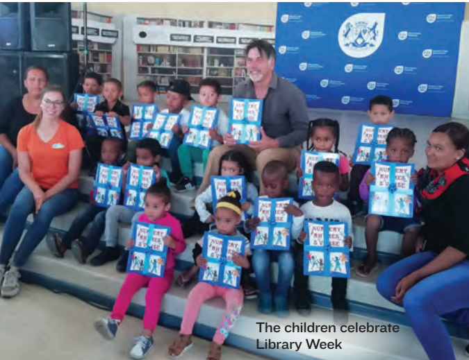
The children celebrate Library Week