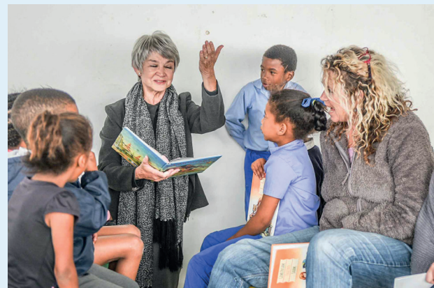
▲ Life Skill Workshop: Reading

Our Life-Skill Center opens their doors every day when St. Augustine Elementary School ends at noon. A hot lunch cooked by grandmothers is waiting for them there before the various afternoon activities start. In addition to homework supervision and free play, “HOOPSIG” offers activities in reading, gardening, Lego, sports, sewing and much more. Our team tries to cater to the different levels of achievement and support needs of the children.