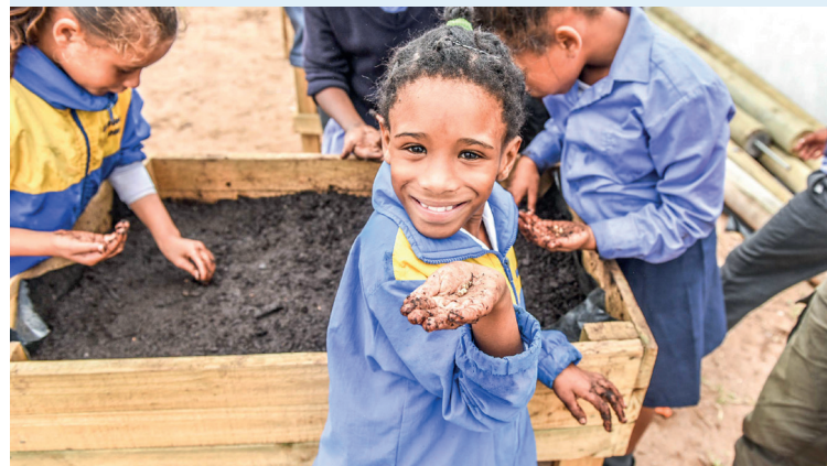
▼ Life Skill Workshop: Gardening