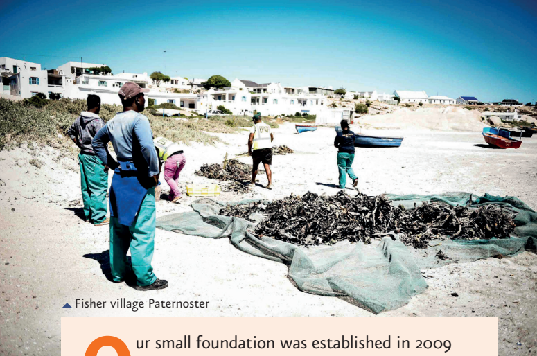
▲ Fisher village Paternoster

Our small foundation was established in 2009 and is based in Stuttgart, Germany. Our central theme was and is the promotion of reading. In October 2016, we started our commitment in Paternoster, South Africa. We had made it our mission to show children in underprivileged regions of the world future prospects by offering life skill workshops such as reading, which will enable them to work and live in their home country. At the same time, we want to give students from various disciplines such as teaching, special education and social pedagogy from South Africa and Germany the opportunity to gain intercultural experience and valuable skills for their profession and their lives. The focus is on learning from and with each other!