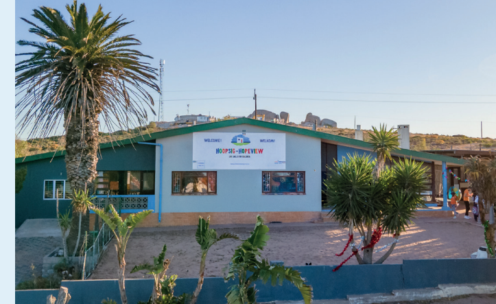
▲ The life skill center “HOOPSIG”